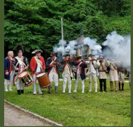
Marching Through Time Jun. 10