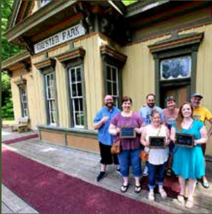
Escape the Village Mar. - Sept.

Experience history with one of our upcoming events or a tour of the Village!