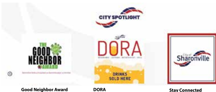
Good Neighbor Award

We hope that you find the website redesign more user friendly, and it helps you stay connected to Sharonville!