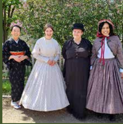
Heroines of Our History Apr. 29